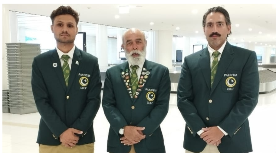
14th King Hammad Trophy, Bahrain 2022

The Team Manager expressed, "We thoroughly enjoyed our stay and greatly appreciated the warm hospitality extended to us by the Egypt Golf Federation.