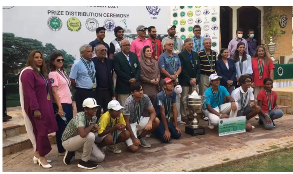
Group Photo of Winning Team, 2nd PGF Inter Club, Karachi

Karachi golf team emerged the country's champion club after securing victory in the three-Pakistan round Golf Federation (PGF) Inter-Club Golf Championship 2021-22 held at the Karachi Golf Club Golf Course on Sunday. Peshawar Golf claimed the runners-up position.